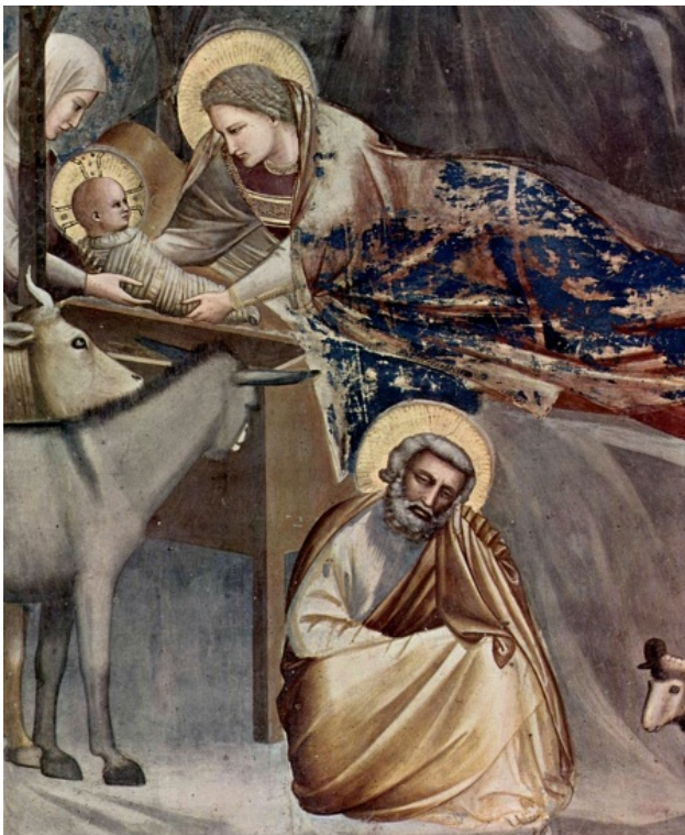
Giotto 1266-1337. Birth of Christ from Art in the Christian Tradition a project of the Vanderbilt Divinity Library, Nashville, TN.

Phone: 508-315-3170 www.Christnatick.org Email: office@Christnatick.org