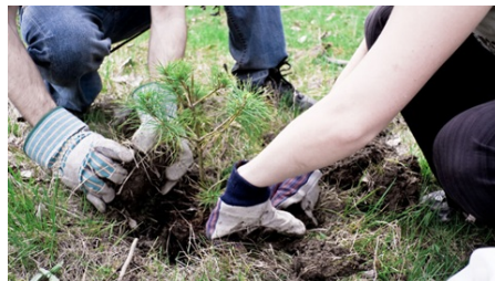
Gardening Day Saturday, April 24

It's spring clean-up time, and this time, it's a triple opportunity: come Saturday, April 24, anytime between 8:30 and noon, and get some exercise while soaking up Vitamin D; see live people, in person, and just maybe, take home some plantings from CLC for your own gardens. Rumor has it there may be goodies, to boot!