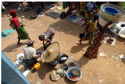
A market in Togo.